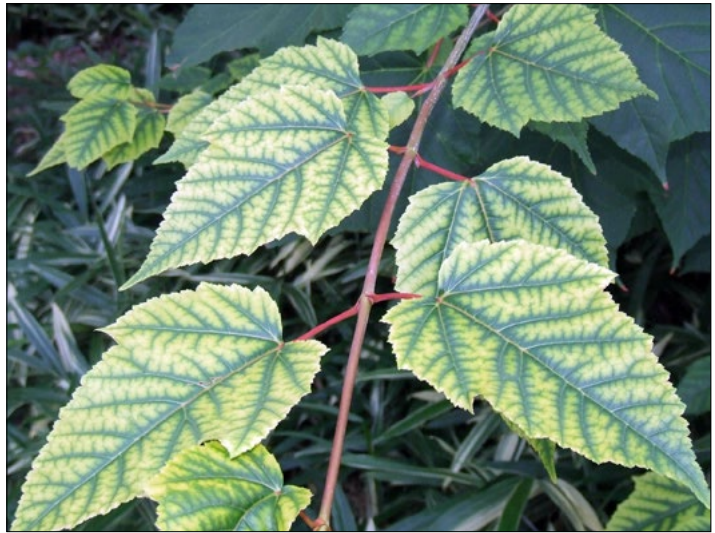
This striped maple is showing a deficiency caused by a high pH.

It is important to remember that not all soils are created equal. Depending on a soil's parent material, organic matter, temperature and moisture, changing soil pH may take time. Soils have the ability to buffer or resist